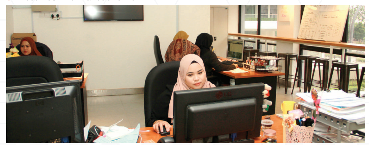
02 ACCOMODATION & COUNSELOR

In aligning with students' needs, Vision College has allocated a new place for the Students' Live Centre on 2nd April,2018. Both the Students' Affairs and Accommodation teams have been relocated at the centre to provide the best services to our students. The main purpose of this centre is to build a friendly rapport with the students by promoting students' activities and in-college experiences. The respective teams will be there to receive feedbacks, solve problems, and provide necessary services. Students are always welcome to discuss and talk to the representatives. This fully renovated centre also contains a lounge area for the students to chill and relax.