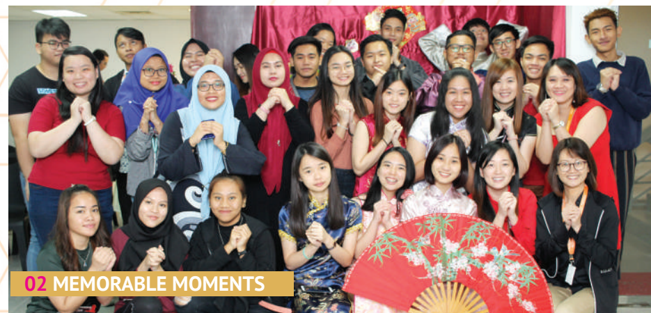
02 MEMORABLE MOMENTS